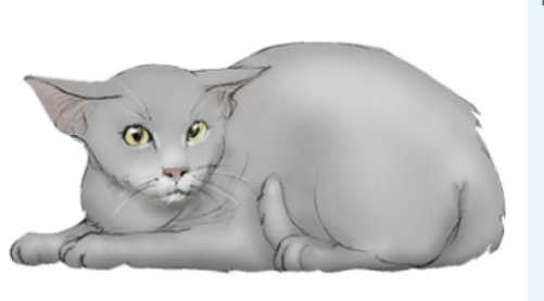
Ears will become flattened, pupils dilate, their whiskers become flattened to their face, tail tucked underneath their body.